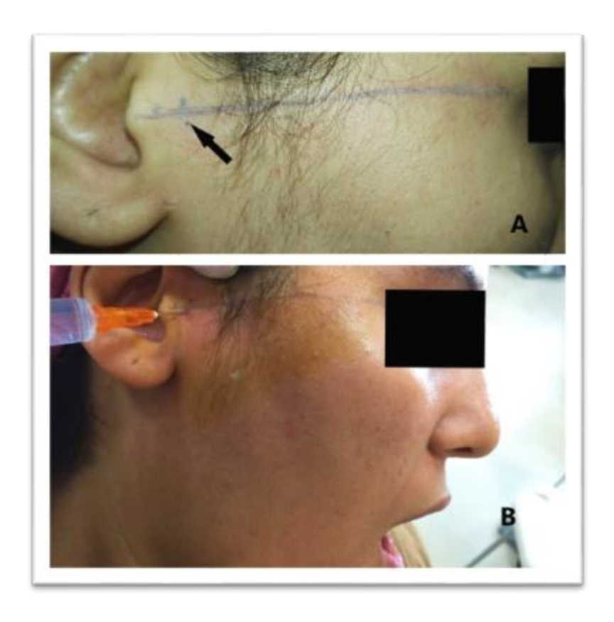
(Fig.1): a clinical intra-operative photograph showing A: localization of the anatomical land mark and the needle insertion point (black arrow); B: a clinical intra-operative photograph showing the injection of collagen in one of group I patients.